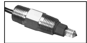
GLL110129 shown with quartz tip